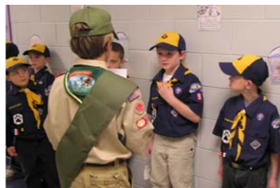
November Pack Meeting- Uniform Inspection!